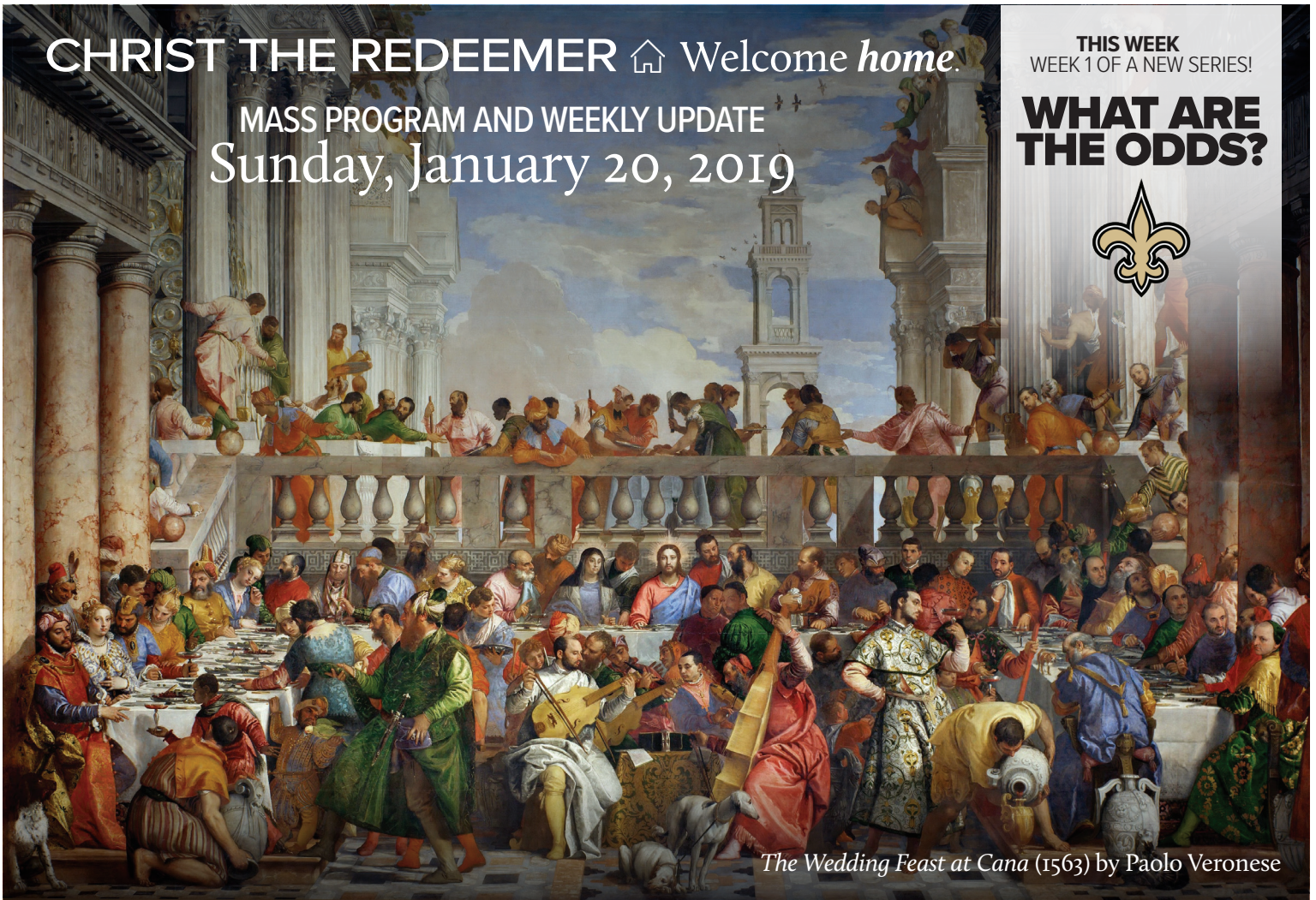
The Wedding Feast at Cana (1563) by Paolo Veronese